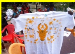
A T-Shirt with artwork done by one of the children.