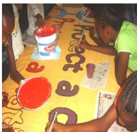
Making a Banner!

During the first week of the Summer Programme, the children participated in activities such as drama, dance and banner making. They also made creative collages and paintings. These drama & dance sessions were conducted by facilitators from the Theater Guild Company and Krystal Lite dance group respectively.