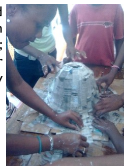
Above: Getting their hands messy! A Paper Mache Volcano

Week 3 the children participated in fun activities that involved making several craft items. These included creating African masks in keeping with Freedom Day; fabric painting, making paper mache volcanoes, family trees, and murals.