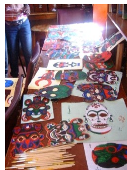
Left: Freedom Day Masks