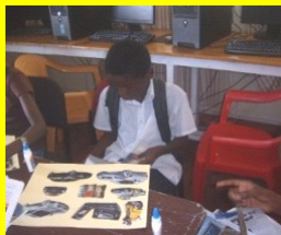
Making a Collage