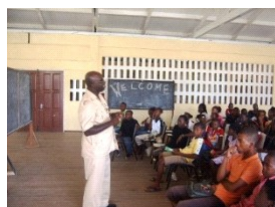
Left: A member of the Guyana Fire Service in a career guidance session with the children.

In week 2, the children were treated to a series of motivational speeches on varying careers. For four days, individuals representing a particular job field, visited YYC & spoke about their career accomplishments. Guest speakers came from GHARP (medical field), Guyana Fire Service & Guyana Defense Force (national security), Coaches and players for various sporting activity, and Media and Culture figures.