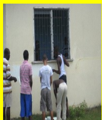
Restoration of BV Community Centre (BBBS).