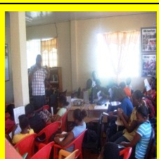
Youth participating in a conflict resolution workshop, hosted by the ERC.