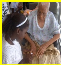
Community Service: Caring for the elderly